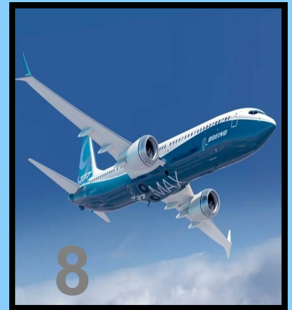
Boeing 737 MAX