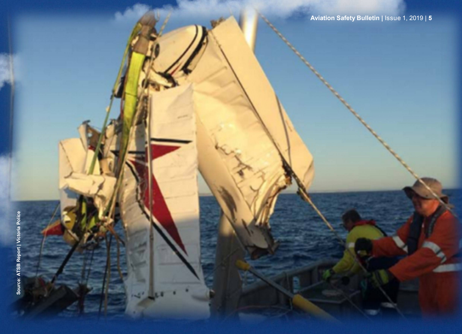
Recovery by Victoria Police of the aircraft's fin and left horizontal stabiliser